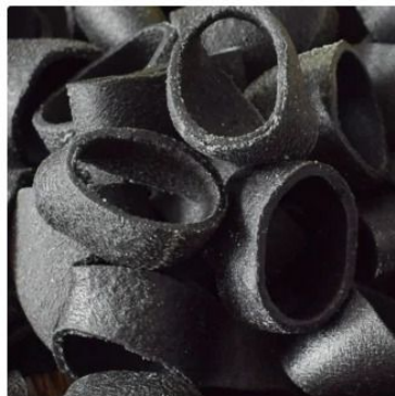
Calamarata al nero di seppia